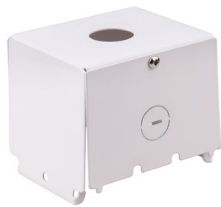
Pendant Mount LHB04-BKT | LHB04-BKT-XL