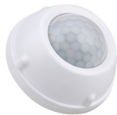
Infrared Motion Sensor MS01-PIR-TW-DC