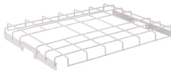
Wire Guard LHB04-WG-SM | LHB04-WG-LG | LHB04-WG-XL