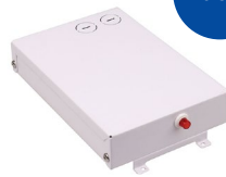
Emergency Driver YH36-25WL-300