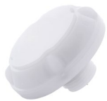
Motion Sensor MS04-MW-TW-DC

Accessories to meet your projects every need (sold separately)