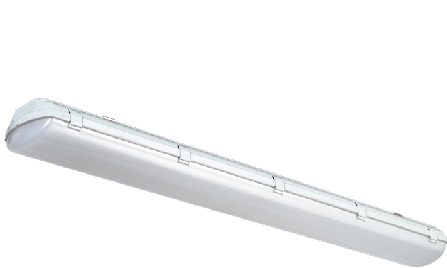
Pictured: MX486 -LD60W