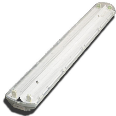
Fixture for Direct Lit Vapour Proof