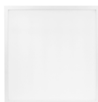
2' x 2' Panel Light

PLS14-40W-3P-3CCT-UD PLP14-40W-3P-3CCT-UD