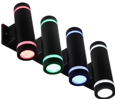
WCYL RGBW 30W

This fixture uses RGBW colour allowing you to customize your space using either red, green, blue, or white light. With a dimming and fading feature this fixture can set any mood you are looking for. This fixture is 30W with a 120-277V low volt driver.