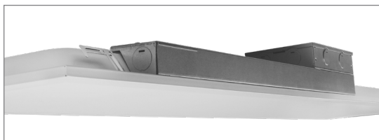
Junction Box (PLS-JB) sold separately