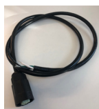
Single ended Cord SL-1MCORD-SINGLE