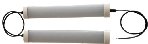
Shown with double ended cord for daisy chaining and power input cord (ordered separately)