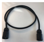
Double ended Cord SL-1MCORD-DOUBLE