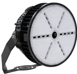
SP01B-500W-50K-30D-UD 404 x 397 x 417 mm