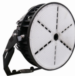
SP01B-750W-50K-20D-UD 523 x 464 x 521 mm