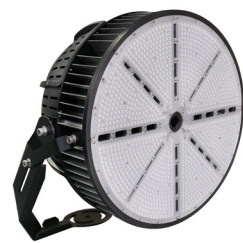
SP01B-1000W-50K-20D-UD 680 x 630 x 585 mm