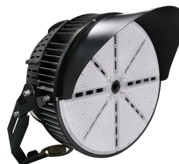
Pictured: SP01B-1000W-50K-UD with SP01-VISOR-C