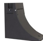
Horizontal Arm FL01P-HA