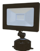
Shown with round junction box