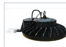
Shown with OPTIONAL MOTION SENSOR KIT #HBE-F-MS-IO