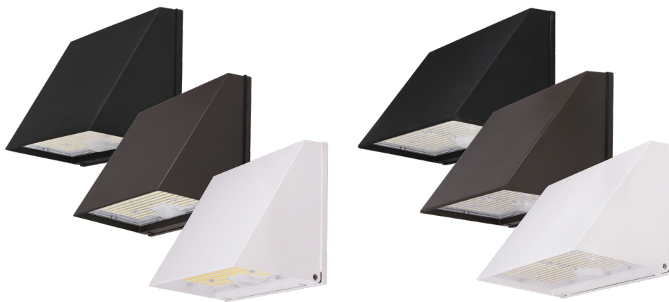
Pictured: 40W Models

Our Keystone Wall Packs set a new standard for outdoor lighting, combining style, functionality, and ease of installation into one exceptional product!