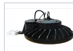
Shown with OPTIONAL MOTION SENSOR KIT #HBE-F-MS-IO