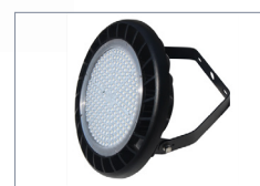
Shown with OPTIONAL YOKE #HBE-yoke

Suitable for use in hockey rinks and food processing facilities